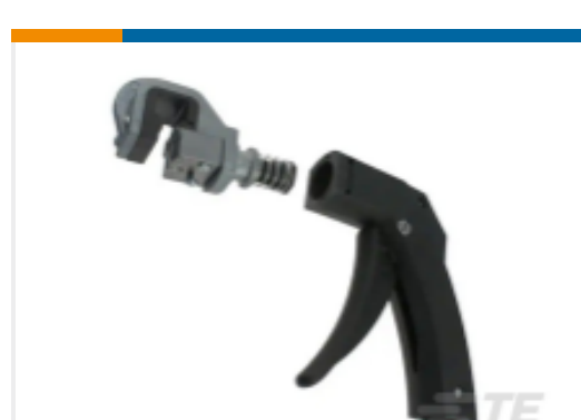
TE Part # 608868-1 HDE HT PKG FOR SUB D