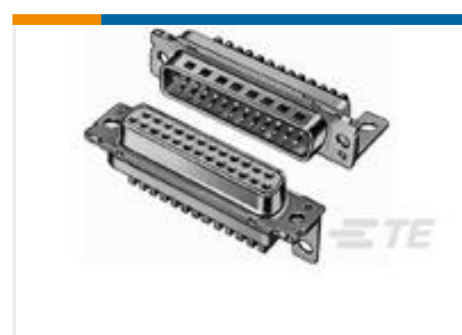
TE Part # 8-1393480-3 V23529B1223B225=SUB D FEDERLEI