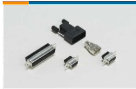
Crimp D-Sub Connectors(1)