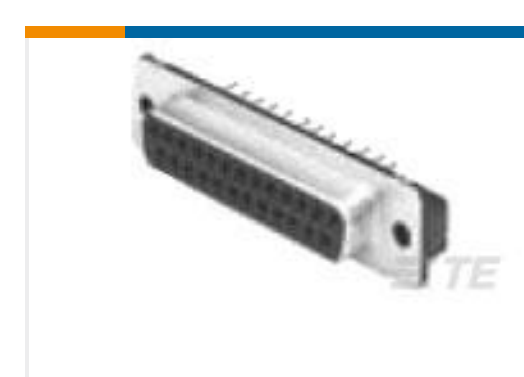
TE Part # 9-338315-2 25POS.HD20 REC.ASSY