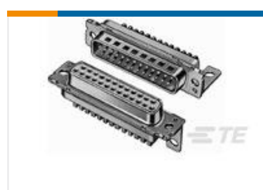
TE Part # 1393481-2 V23529B1225B225=SUB D FEDERLEI