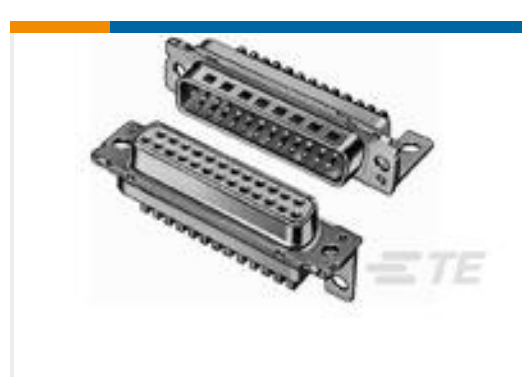
TE Part # 8-1393480-4 V23529B1223B237=SUB D FEDERLEI