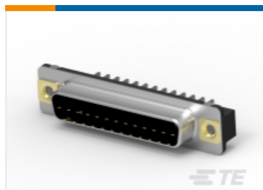
TE Part # CAT-026-RAVSAP3277 D-Sub Receptacle Assembly: Vertical, Action Pin, Shell Size 3, 2.77mm