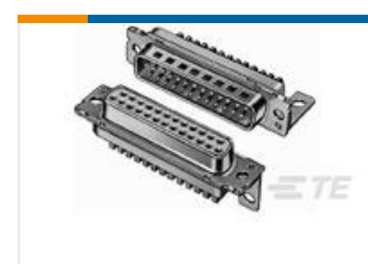
TE Part # 9-1393480-2 V23529B1224B225=SUB D FEDERLEI