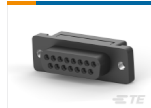
TE Part # CAT-AM7-253 IDC D-Sub: Receptacle Assembly, Low Profile, Signal, 2.77 mm