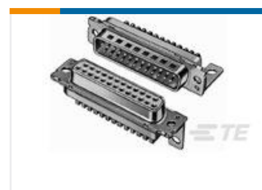
TE Part # 3-1393480-0 V23529B1122B225=SUB D FEDERLEI