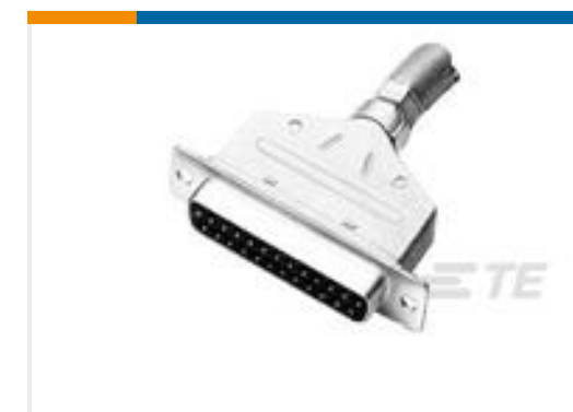
TE Part # 747548-8 KIT, RCPT, 25P, HDE, SHLD HDWRE