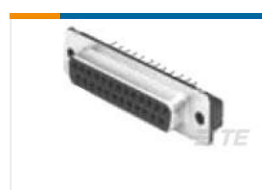
TE Part # 8-338315-2 25P.HDP20 REC.ASSY