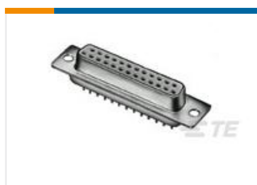
TE Part # 7-1393740-2 V42254A2216B225=SUB D FEDERLEI