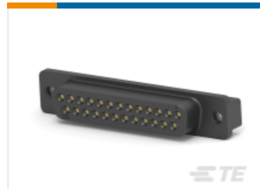
TE Part # CAT-025-DRAVS3277 D-Sub Receptacle Assembly: Vertical, Shell Size 3, 2.77mm