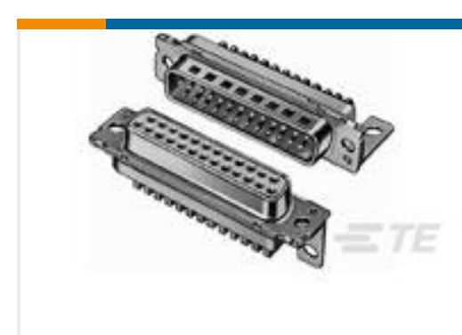
TE Part # 5-1393480-7 V23529B1221B225=SUB D FEDERLEI