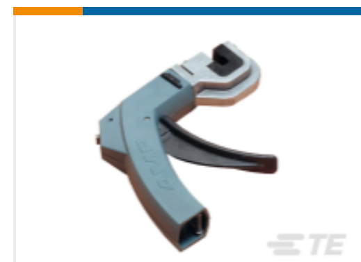
TE Part # 58074-1 MTA 50/100/156 MANUAL TOOL FRAME