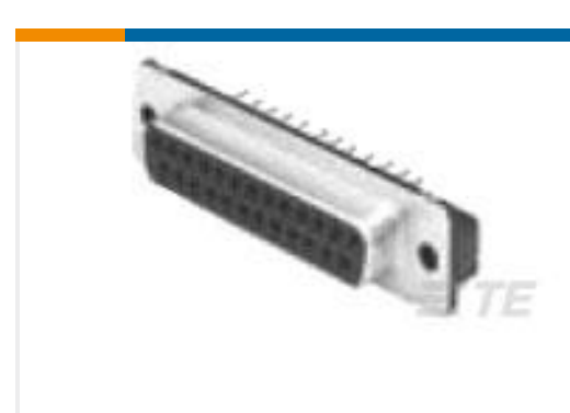
TE Part # 7-338315-2 25POS.HD20 REC.ASSY