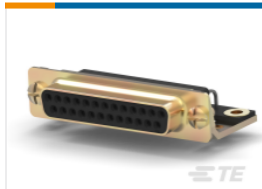
TE Part # CAT-023-DRARS3277 D-Sub Receptacle Assembly: Right Angle, Shell Size 3, 2.77mm