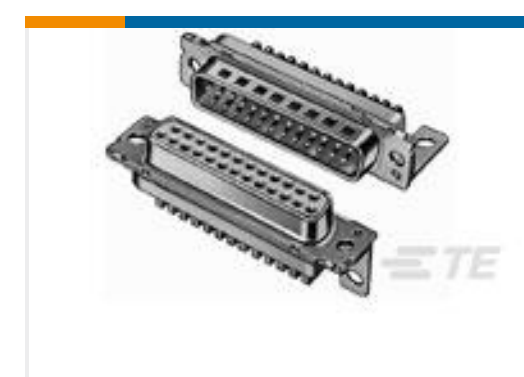
TE Part # 1-1393480-9 V23529B1121B225=SUB D FEDERLEI