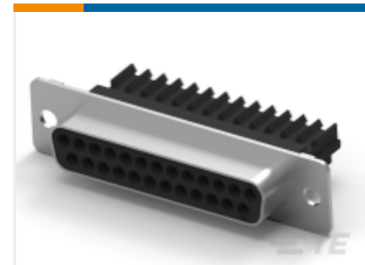
TE Part # CAT-AM7-248H5 IDC D-Sub: Receptacle Assembly, Wire to Wire, Signal, 2.77 mm